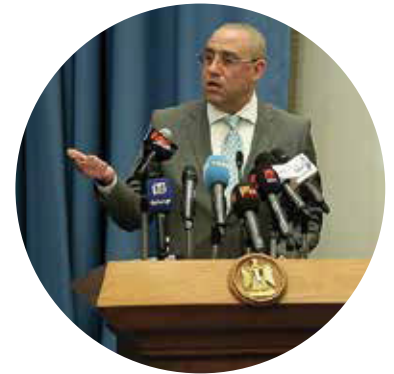
Dr. Assem Elgazar Minister of Housing, Utilities & Urban Communities