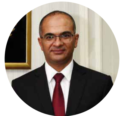
Dr. Saied Ismael vice Minister of Housing for Infrastructure Affairs